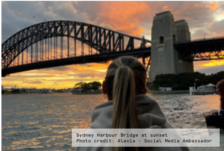
Sydney Harbour Bridge at sunset