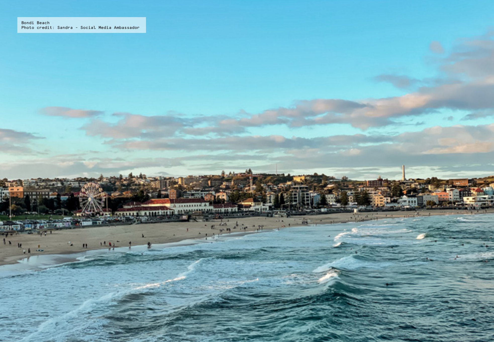
Bondi Beach