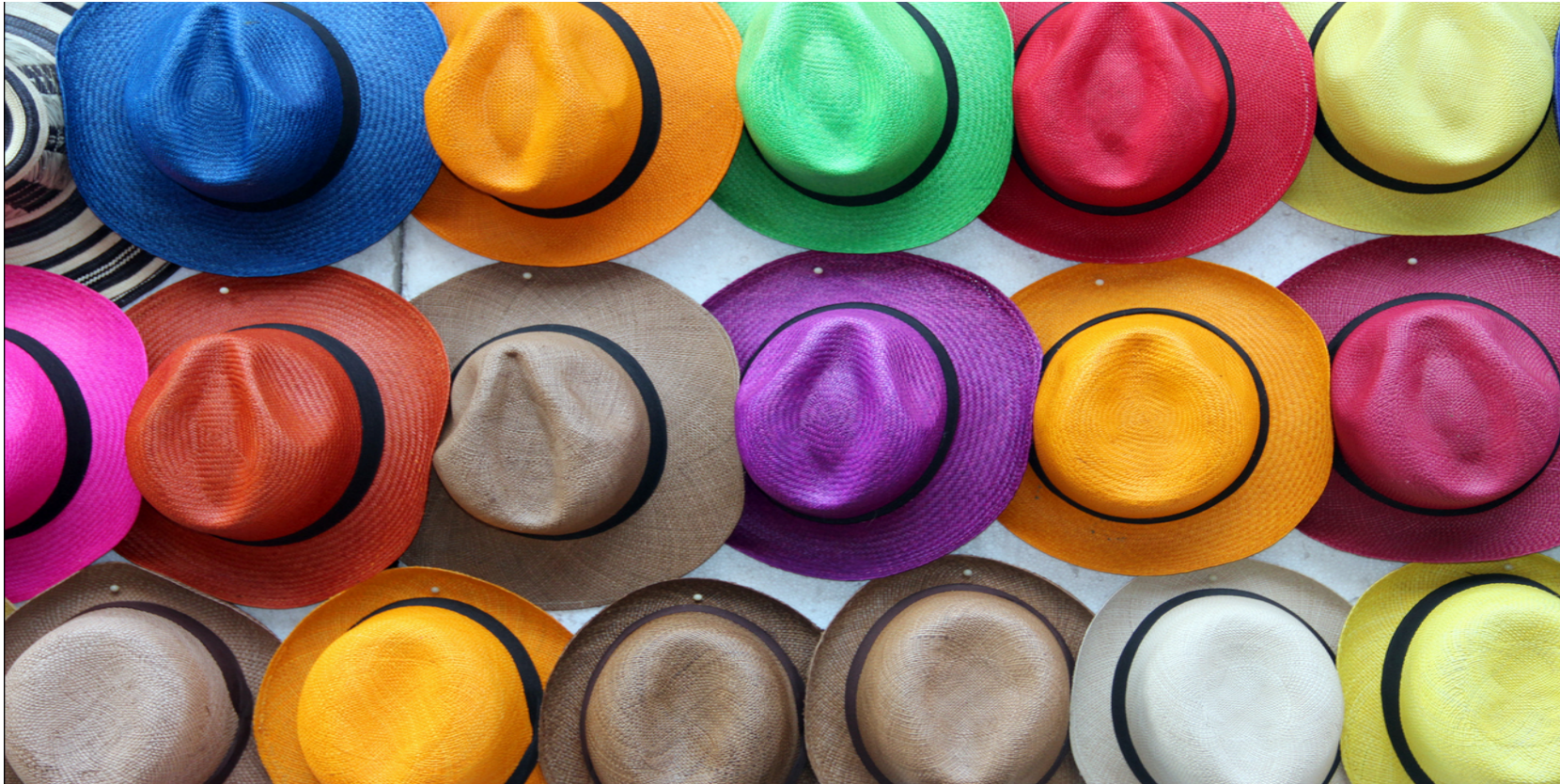
Alan Shipley, flickr