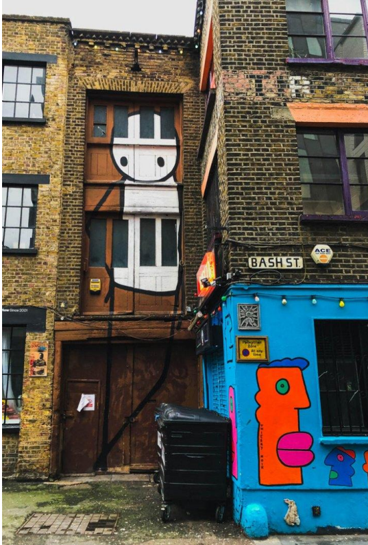
Mural by Stik on Rivington Street in Hackney