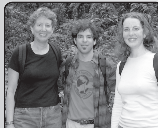
Faculty and advisers visit Field Botany of the Andes in Venezuela.