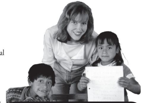
Internship in Quito, Ecuador